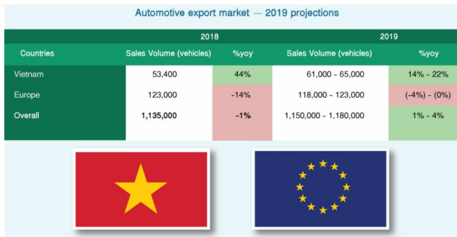
Figure 3. Automotive export market -2019 projections